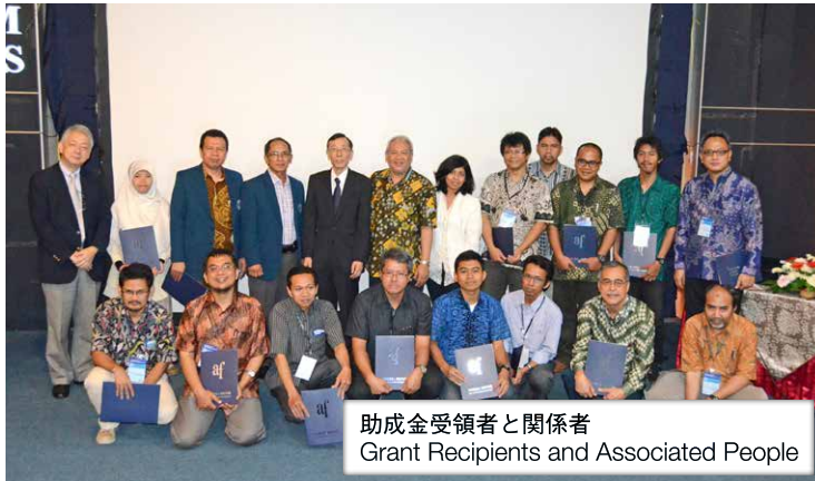
助成金受領者と関係者 Grant Recipients and Associated People