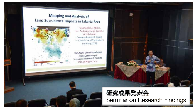
研究成果発表会 Seminar on Research Findings