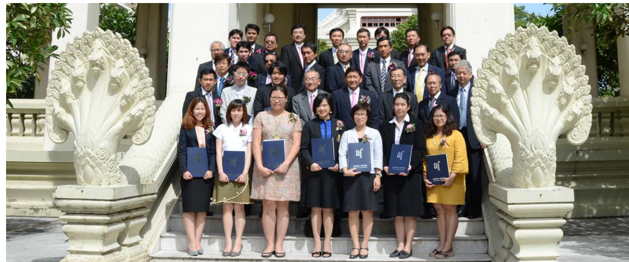
Grant recipients and associated people from CU and the Asahi Glass Foundation