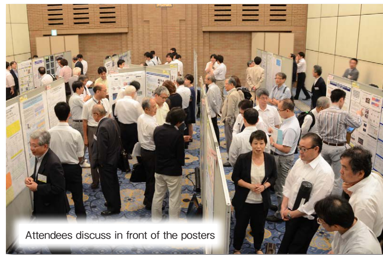
Attendees discuss in front of the posters