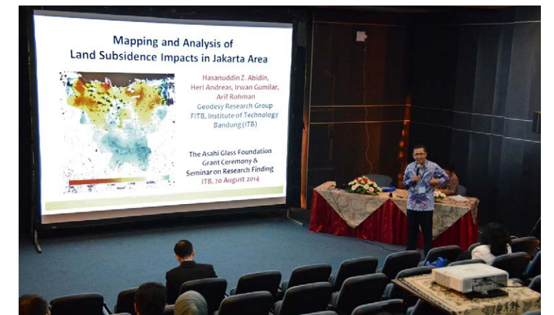
Presentation of research results