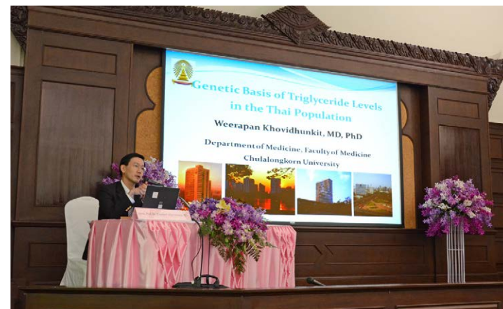
A presentation of research results given at the seminar