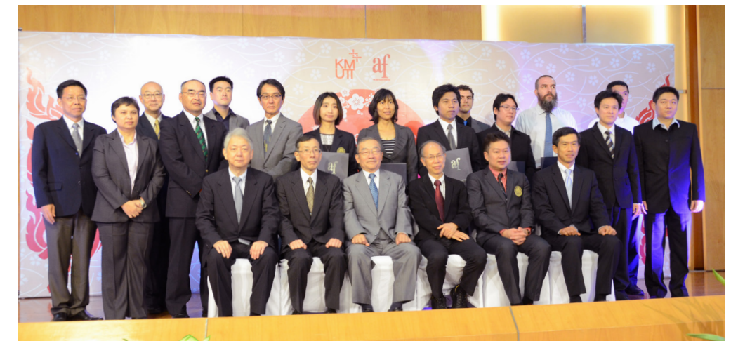
Grant recipients and associated people from KMUTT and the Asahi Glass Foundation