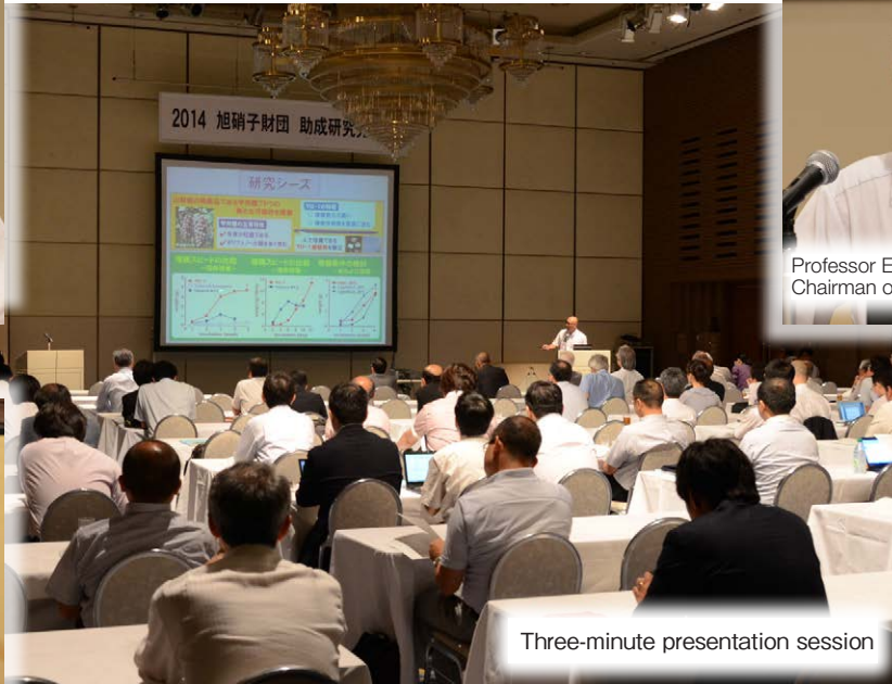
Three-minute presentation session