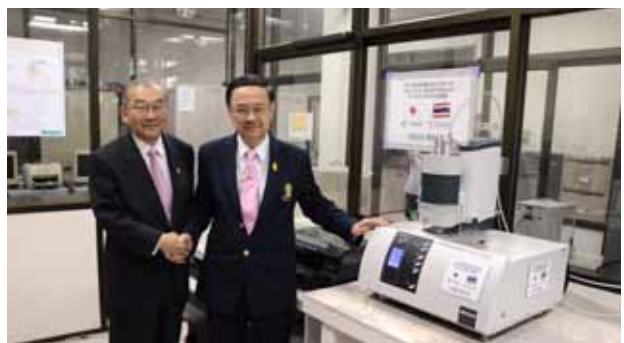
The thermal analyzer