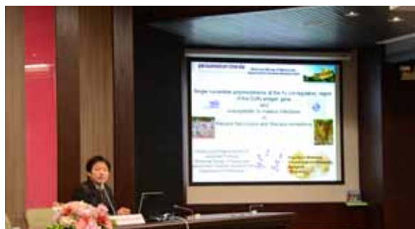
A presentation of research results given at the seminar