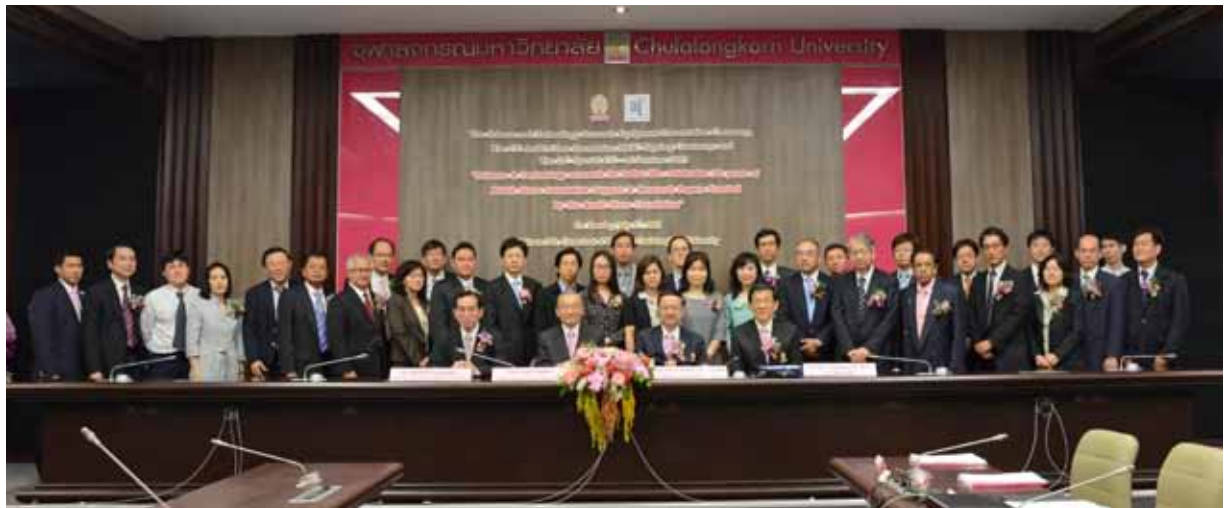
Grant recipients and associated people from CU and the Asahi Glass Foundation