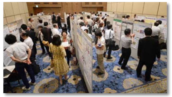
Attendees view the posters

A fter the presentations, all attendees attended the social function.