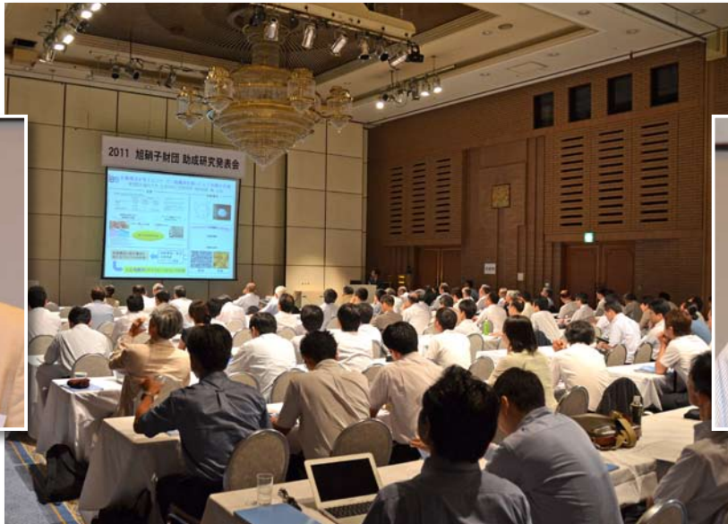
A three-minute speech