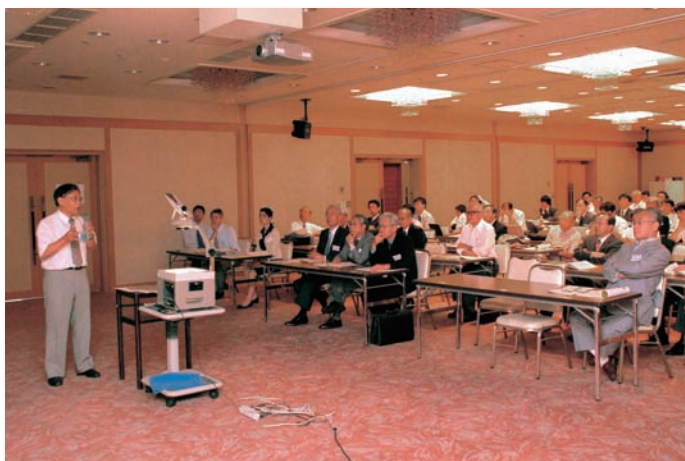
Three-minute speeches in the presentation hall