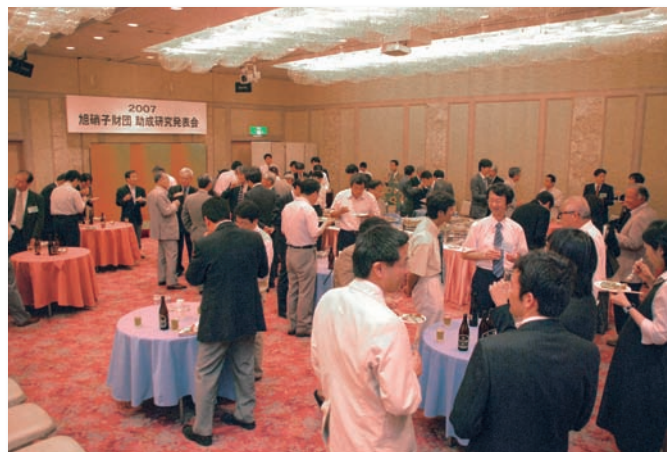
Party after the seminar