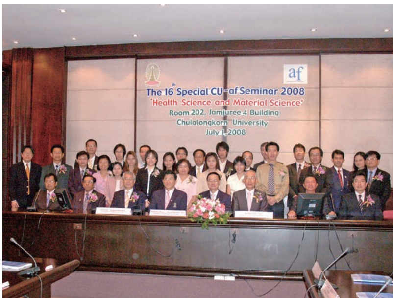
Grant recipients with Chulalongkorn University and Asahi Glass Foundation personnel