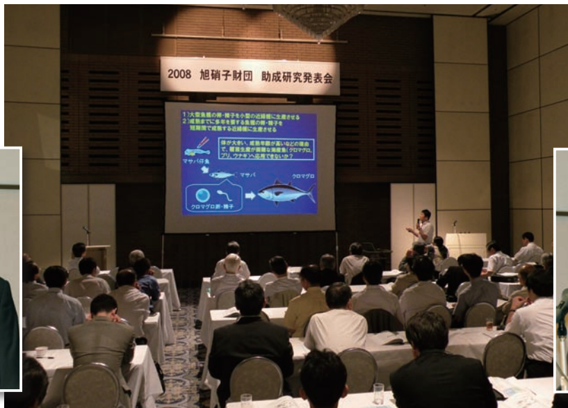
Three-minute speeches in the presentation hall