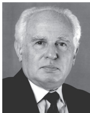
Professor, Institute of Electrotechnics and Energy, University of São Paulo Former Rector, University of São Paulo

Professor Goldemberg began making a thorough study on energy problems from the late 1960's, and in 1973 after the oil crisis he served a major role in the adoption of bio-ethanol program, thus had made major contributions in formulating and promoting energy policies in Brazil. In the 1980's he designed an energy strategy which contributed to global sustainable development in which he devised a pioneering concept of "technological leapfrogging" for the developing countries where they could develop through strategies by introducing innovative technologies and with this concept he made a significant contribution in promoting renewable energy for a sustainable development. In 1992 as the Environment Minister of Brazil, he was active in preparing for the Rio Earth Summit and afterwards he exhibited strong leadership on environmental issues including energy, global warming, ethics, policies and deforestation, not only in Brazil domestically but also internationally including United Nations and other organizations, and in particular, he contributed in the implementation of many policies associated with improvements on energy use and conservation.