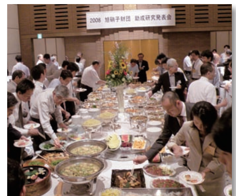
Party after the seminar