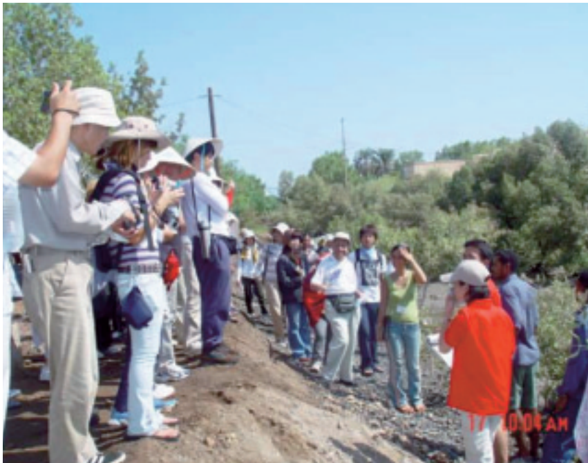
Figure 11. Passengers from Japanese Peace Boat visiting the work site in Hargigo.