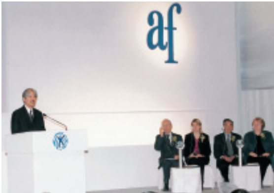
His Imperial Highness Prince Akishino congratulates the laureates