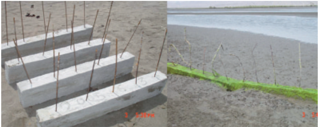
Figure 3. Concrete blocks with protruding iron bars. In final position they build up soil on landward side.