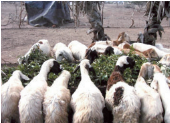
Figure 6. Sheep eating mangrove foliage.