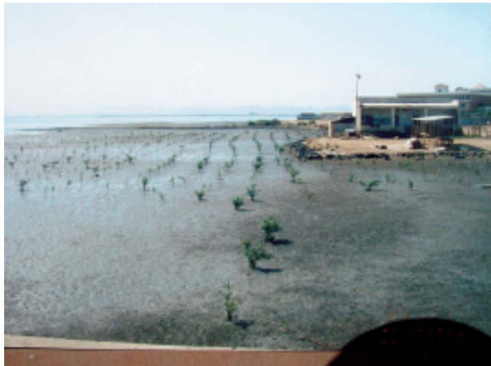
Figure 1. Mangrove planting in area where mangroves had not grown before. About a year after planting.