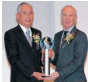
Prof. Sir Nicholas Shackleton