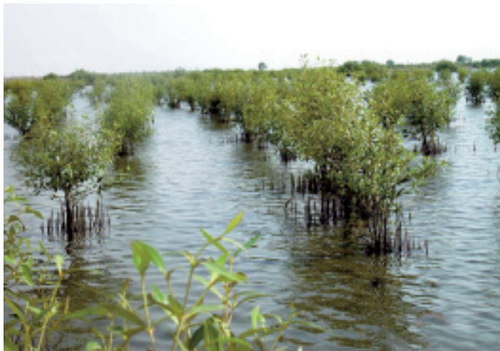
Figure 8. Mangrove grove in village of Hargigo.