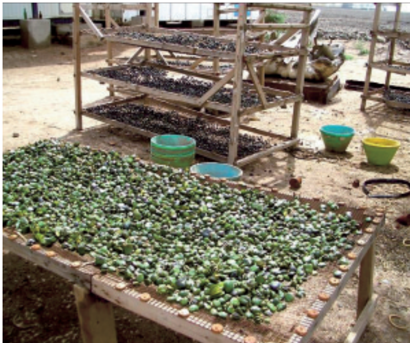
Figure 4. Peeled Avicennia seeds drying in the sun