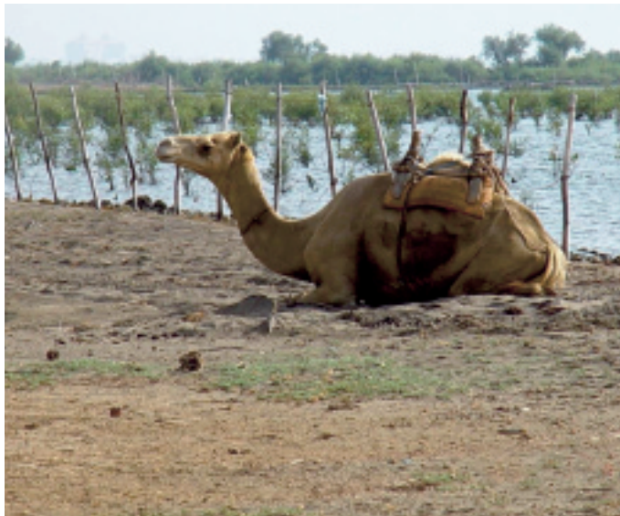
Figure 7. Camel lusting after mangrove trees.