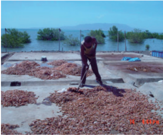
Figure 5. Fish wastes being sun dried after brief boiling.