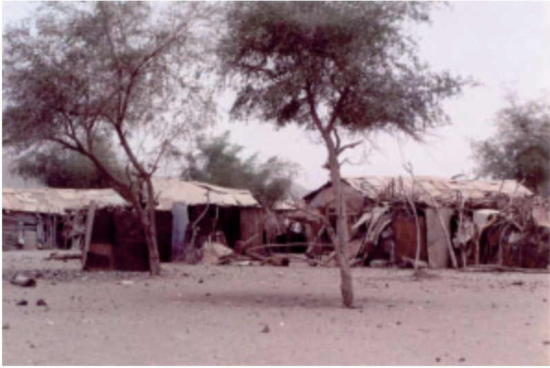
Figure 9. Typical housing in Hargigo