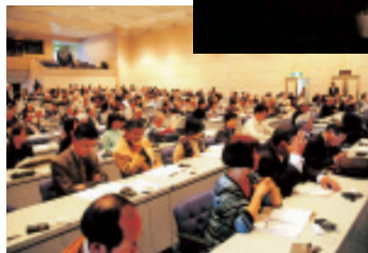
Blue Planet Prize Commemorative Lectures