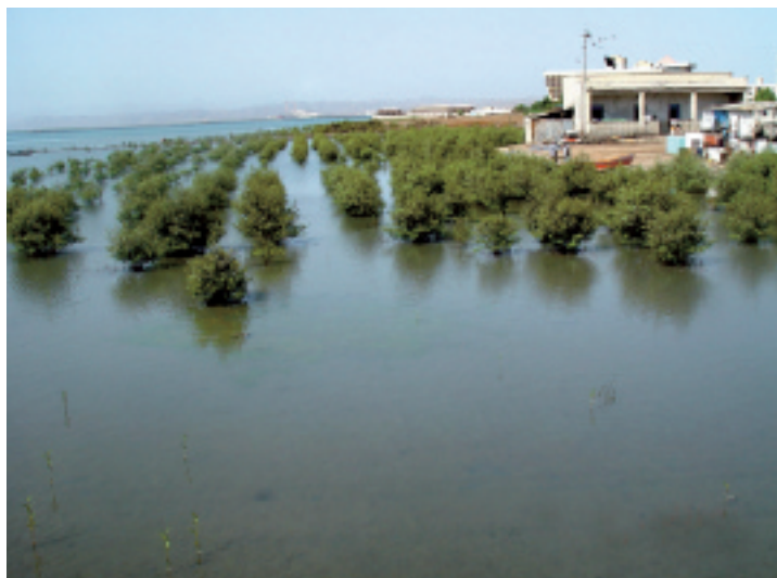
Figure 2. Same scene as in previous slide, but three years after planting