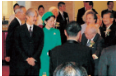
Their Imperial Highnesses Prince and Princess Akishino congratulate the laureates at the Congratulatory Party