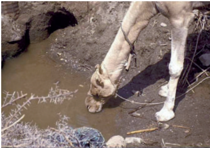
Figure 10. Source of village water.