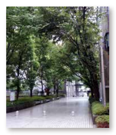
Science Plaza south entrance (Coming from the Joshi Gakuin side)