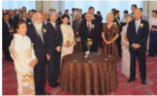
Their Imperial Highnesses Prince and Princess Akishino congratulate the laureates at the Congratulatory Party