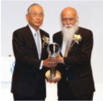
Professor Hirofumi Uzawa