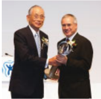
Lord (Nicholas) Stern of Brentford