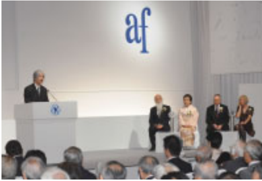
His Imperial Highness Prince Akishino congratulates the laureates