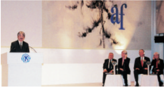
His Imperial Highness Prince Akishino congratulates the laureates