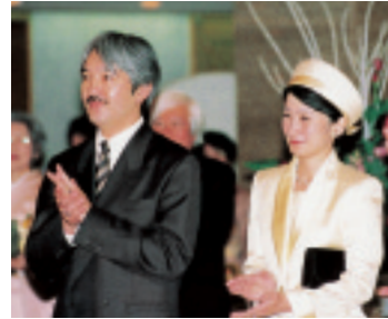
Their Imperial Highnesses Prince and Princess Akishino at the Congratulatory Party