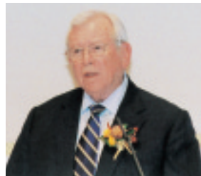
Howard H. Baker Jr., Ambassador of the United States of America to Japan, congratulates the laureates