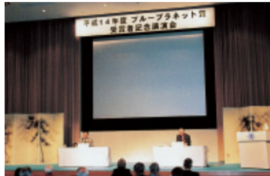
Blue Planet Prize Commemorative Lectures