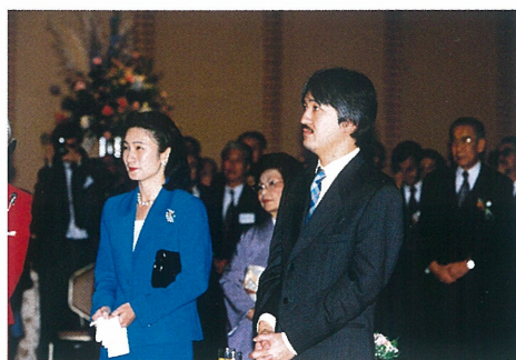
Their Imperial Highnesses Prince and Princess Akishino at the Congratulatory Party.