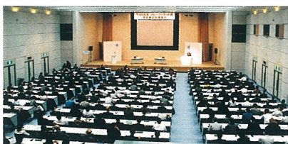
The Blue Planet Prize Commemorative Lectures.