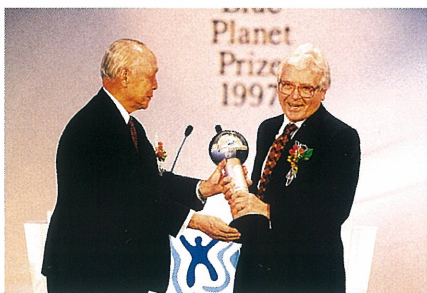
Dr. James E. Lovelock accepts the 1997 Blue Planet Prize.